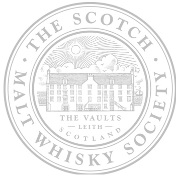
WHISKY No. 1: